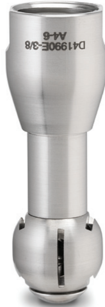
TankJet D41990A tank cleaning nozzle, see page E10