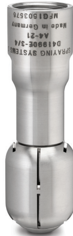
TankJet D41990 tank cleaning nozzle